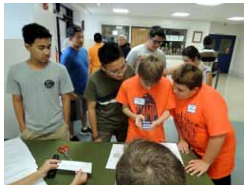
Reporting in during the new student scavenger hunt