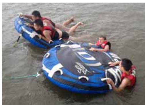
Tubing at Lake Dardanelle - a favored activity of new student orientation