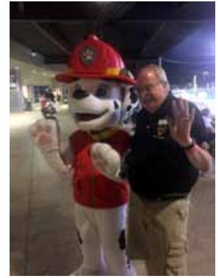
Alumni, friends, and monks enjoyed the camaraderie at the NW Arkansas Naturals baseball game on August 5, 2016.