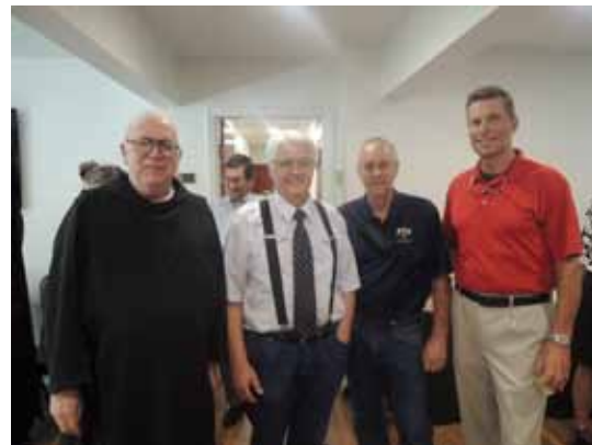
After the Saturday afternoon, August 27, Mass at St. John Church in Russellville, we enjoyed snacks and visiting with Subiaco folks..