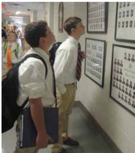
Checking on the men of yesteryear.