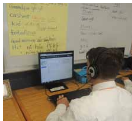
Learning Mandarin Chinese with the help of technology